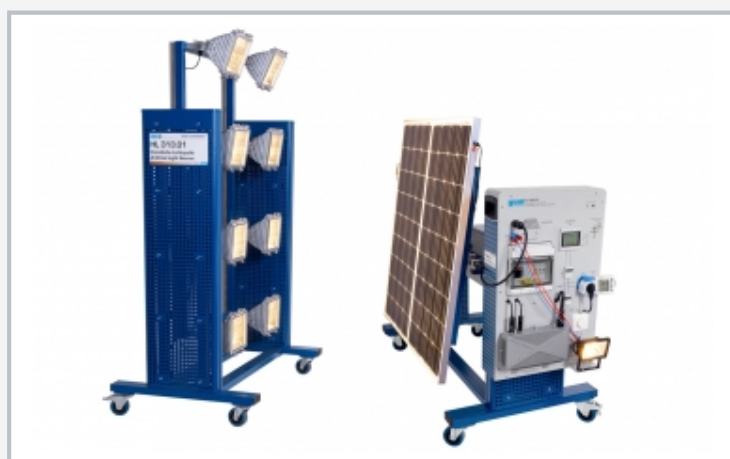
The illustration shows ET 250.01 together with ET 250 and the artificial light source HL 313.01