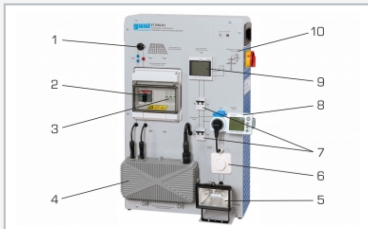
1 connector for photovoltaic modules, 2 DC switch-disconnector, 3 over voltage protection, 4 inverter, 5 halogen lamp, 6 dimmer, 7 fuses, 8 energy meter own consumption, 9 two way energy meter grid, 10 grid connection